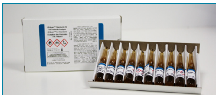
Figure 1. iDQuant™ Standard Kit with mixture of pesticides.

Demand for analysis of pesticides in food has increased many folds in recent years to meet the regulations introduced by EU or FDA and other regulatory authorities. A multi-residue pesticide analysis method was developed using QTRAP® 4500 System in tea matrix. Quantitative and qualitative study was performed to determine and confirm the presence of the 46 pesticides, overcoming the challenges related to the interference from the matrix. The method was found reproducible at the LOD for all the analytes and the %CV was found to be less than (n=6) 10 % for all the pesticides. The LOQ of 1.00 ppb was achieved in the extracted sample.