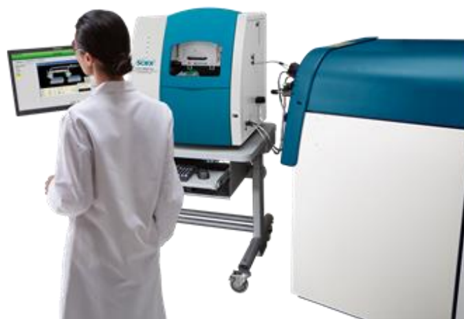
CESI 8000 Plus and TripleTOF® 6600+ System

Further t-ITP-CZE increases the assay sensitivity and separation resolution of glycopeptides. 2,5,6