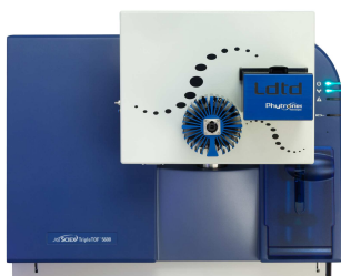
Figure 1 LDTD interfaced to AB SCIEX TripleTOF ® 5600 System