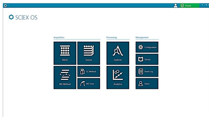
SCIEX OS can deliver faster method set-up