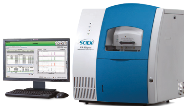
Figure 1: The PA 800 Plus Pharmaceutical Analysis System with laser induced fluorescence detection (CE-LIF).

This Technical Note demonstrates optimization of previously published work 2 including all steps of the rapid magnetic bead based protocol. Modifications include rapid endoglycosidase digestion and fluorophore labeling reaction time, optimized labeling temperature and rapid Capillary Electrophoresis (CE) separation using the PA800 Plus Pharmaceutical Analysis System (Figure 1). The procedure can be performed for as few as a single sample to as many as 96 samples at a time using automated liquid handling platforms without the need for centrifugation or vacuum centrifugation 3 commonly used in other glycan sample preparation methods. Capillary electrophoresis separation with laser-induced fluorescence detection (CE-LIF) of the fluorophore labeled glycans is also optimized to provide rapid and high resolution separations of the labeled sugars in 5 minutes, enabling rapid analysis in both the manual and automated sample preparation processes.