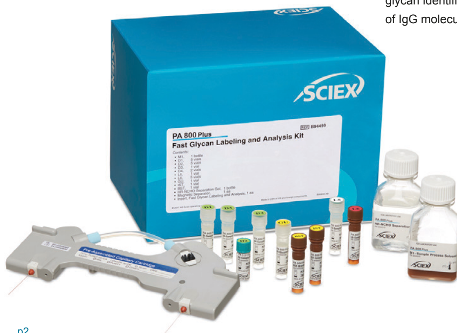
Figure 2: The PA 800 Plus Fast Glycan Labeling and Analysis Kit with high resolution separation gel buffer (HR-NCHO).

In summary, the PA 800 Plus Pharmaceutical Analysis System with the new Fast Glycan Labeling and Analysis Kit provides fast, robust sample preparation and separation with automated glycan identification for comprehensive N-glycosylation analysis of IgG molecules.