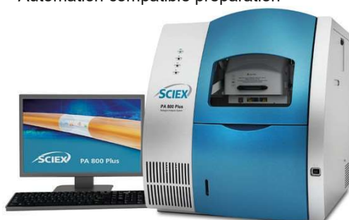
PA 800 Plus Pharmaceutical Analysis System