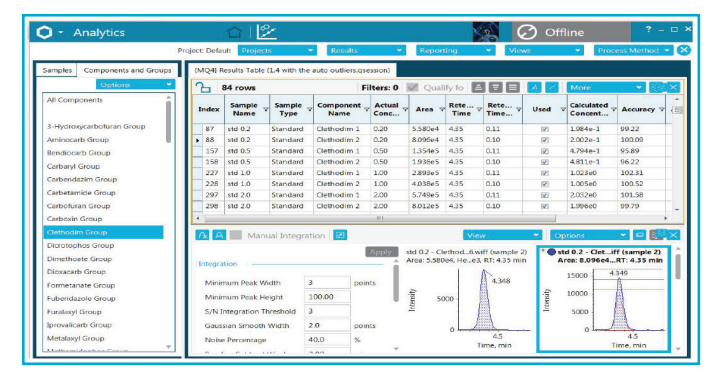
Figure 1. SCIEX OS Analytics workspace showing likeness to MultiQuant™ Software

As the pace of work in analytical laboratories increases and more demands on time, data accuracy and integrity are required, new ways of working are essential to keep up with dynamic industry demands. The new generation of SCIEX data processing software benefits from concurrent license deployment, data security with tools to support 21 CFR part 11 compliance, and with the increased cybersecurity on Windows 10.