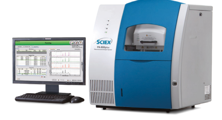
The PA 800 Plus Pharmaceutical Analysis System