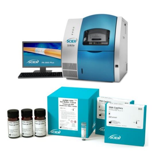
Figure 1. PA 800 Plus(top) and dsDNA 1000 kit (bottom).

In this study, lentivirus samples were used as an example to showcase fragment distribution testing of HCD using the PA 800 Plus for drug analysis with a laser-induced fluorescence (LIF) detector and a dsDNA 1000 kit (Figure 1). Generally, LIF detection can detect as low as 10 pg/mL of total DNA, which is essential to fulfilling regulatory requirements for sensitivity.